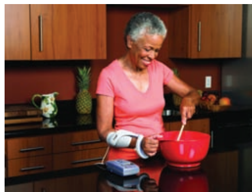
Figure 1: The NESS H200® Hand Rehabilitation System

For years, electrodes were hooked up to single muscles or groups of muscles to facilitate increased movement. The therapist turned on the current while asking the patient to extend their wrist. This treatment operated under the idea that repeated use would strengthen the muscle. Conventional surface neuromuscular electrical stimulation (NMES) is limited by the difficulty in placing the electrodes consistently in the right places, and the failure to perform a coordinated task. What is needed is NMES that will enable the patient to perform a coordinated functional task with the critical number of repetitions (i.e. dose). The repeated movements induced by NMES will reinforce network patterns and lead to enhanced synaptic connections and neural plasticity.