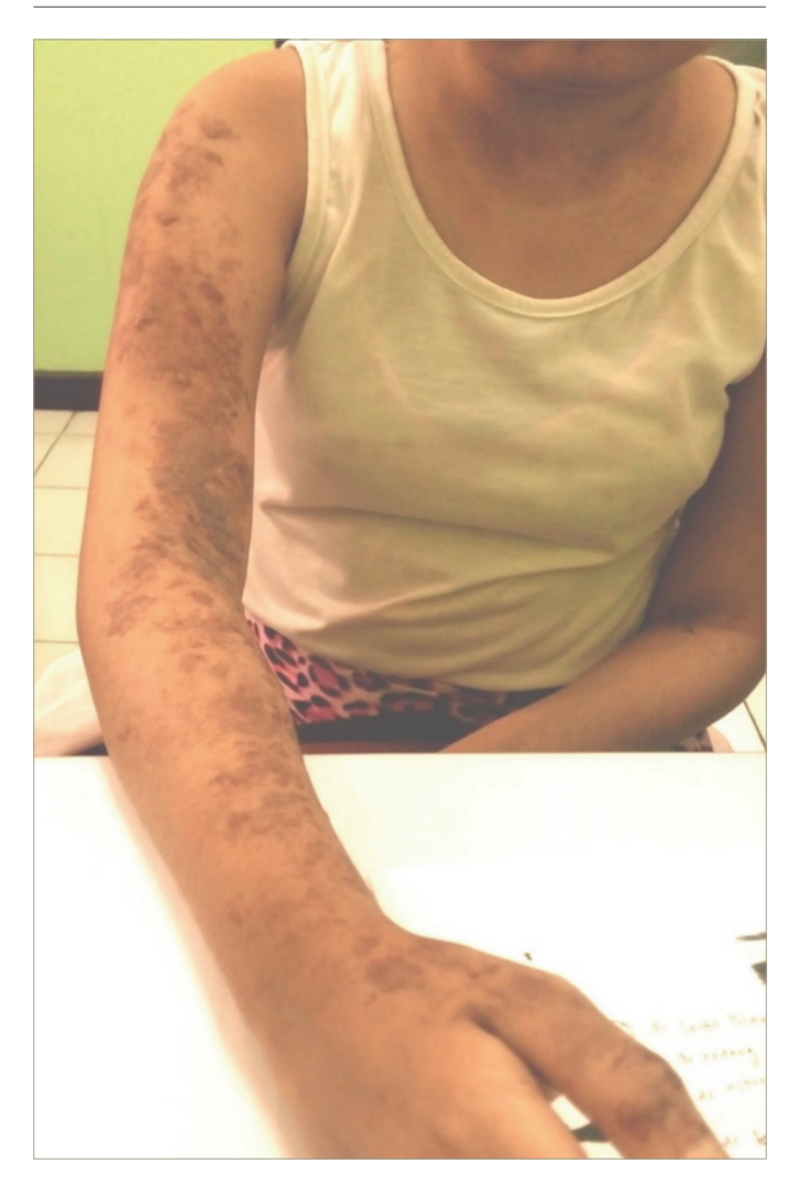
Figure 1: A 16-year-old female with skin lesion characteristic of herpes zoster, distributed in the right C5-C6 dermatomes

patient suffered a herpes infection with manifestations such as clustered vesicles with red macula base, diffuse border, and irregular structure on her skin ( Figure 1 ). At that time, the dermatologist was able to do a Tzanck test and found the appearance of multinucleated giant cell, and treated the patient with oral acyclovir 5 x 800 mg dose. The patient had been diagnosed with SLE 4 months previously (positive antinuclear antibody test, positive Anti-dsDNA IgG IgM, positive Coombs test), and has been receiving 3 x 16 mg methylprednisolone and 2 x 50 mg azathioprine ever since, as the main treatment of SLE.