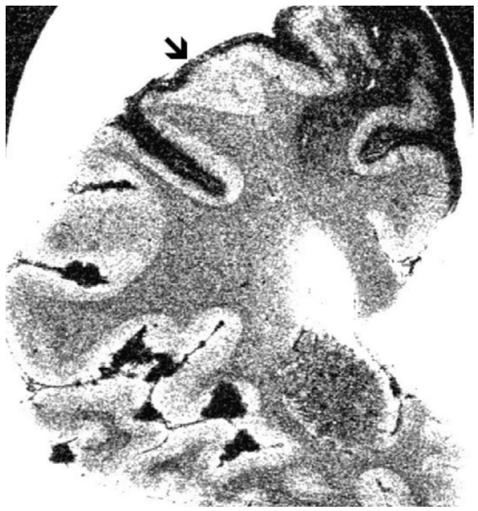
Presence of extensive cortical superficial siderosis as a sequel from an underlying old lobar haematoma (arrow).

Figure 2: Post-mortem Coronal Brain Section of the Right Frontal Lobe on 7.0-T Magnetic Resonance Imaging with T2* Sequence of a Patient Suffering from Cerebral Amyloid Angiography