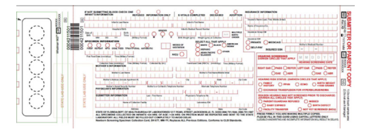
Figure 1: Example of a Filter Card for Newborn Screening, State of Florida

Note the left hand side of the card including the five circles is made of filter paper to hold the dried blood. The remainder of the card is for identifying information and different parameters needed for newborn screening.